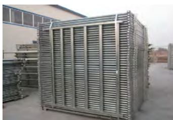
CORRAL PANEL PACKAGE