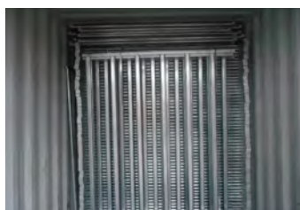
CORRAL PANEL DELIVERY